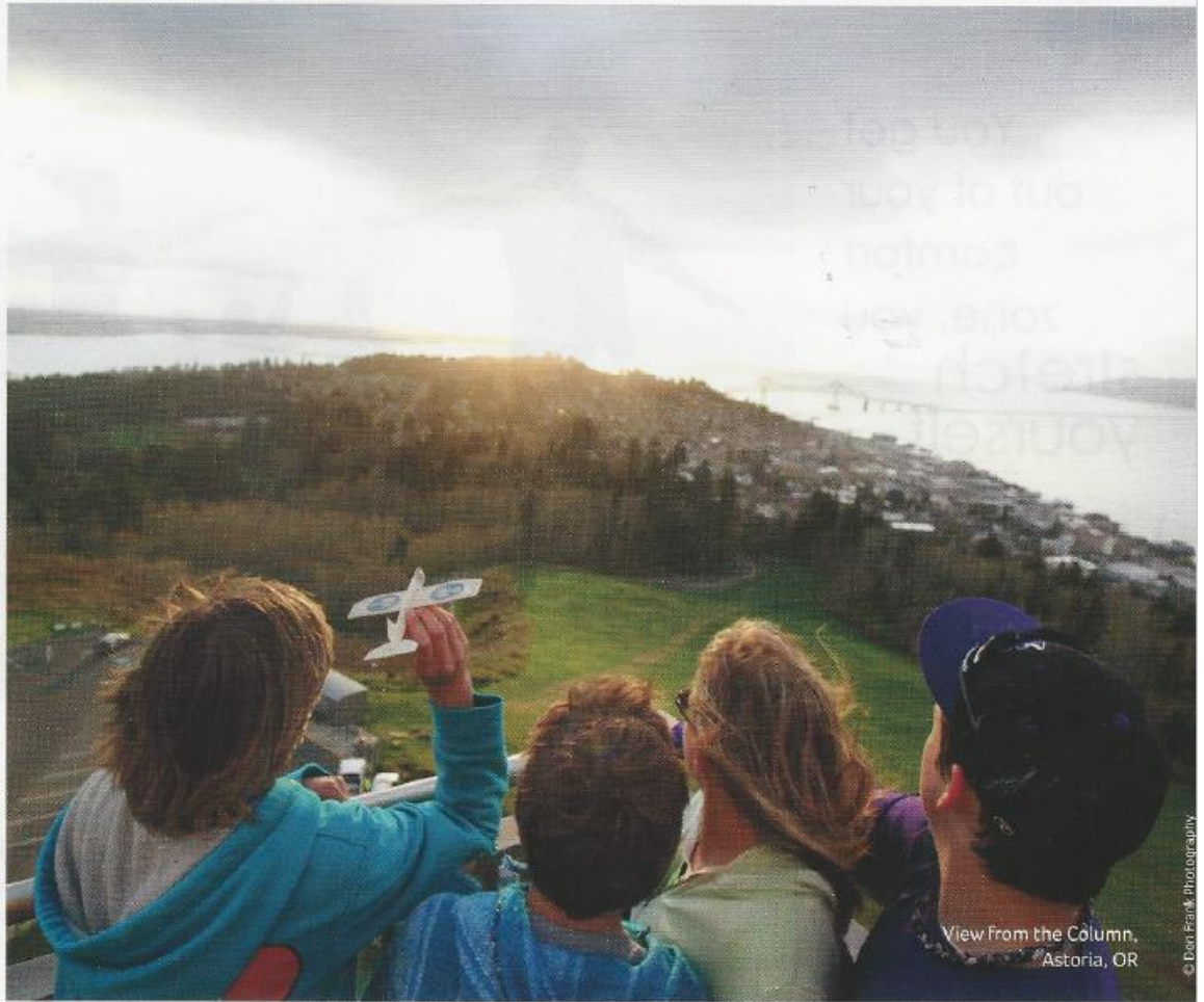
View from the Column, Astoria, OR